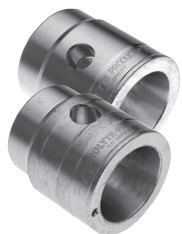
X Coupler - 1 ring

Structural data can be found at www.prolyte.com